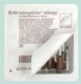
1 mL Allergy Tray with Permanently Attached Needle For Testing